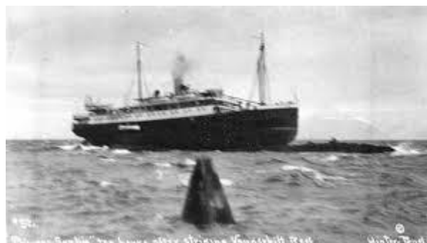
Alaska State Library, Winter and Pond Collection, ASL-P87-1702

October 25, 2017 marks the 99 th anniversary of the sinking of the SS Princess Sophia , a Victoria-based vessel that transported passengers up the coast to Skagway, Alaska, with