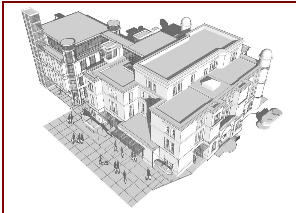
Image One: The Proposed Re-development of 28 Bastion Square as the Site of a New Canadian Maritime Museum with the attached Class A Museum Annex.