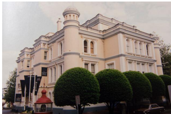
28 Bastion Square

THEREFORE, BE IT RESOLVED that the Maritime Museum of British Columbia Society requests that the Province of British Columbia and the Government of Canada agree to work together toward the official opening of a new Canadian Maritime Museum in Victoria, British Columbia, Canada on July 20, 2021.