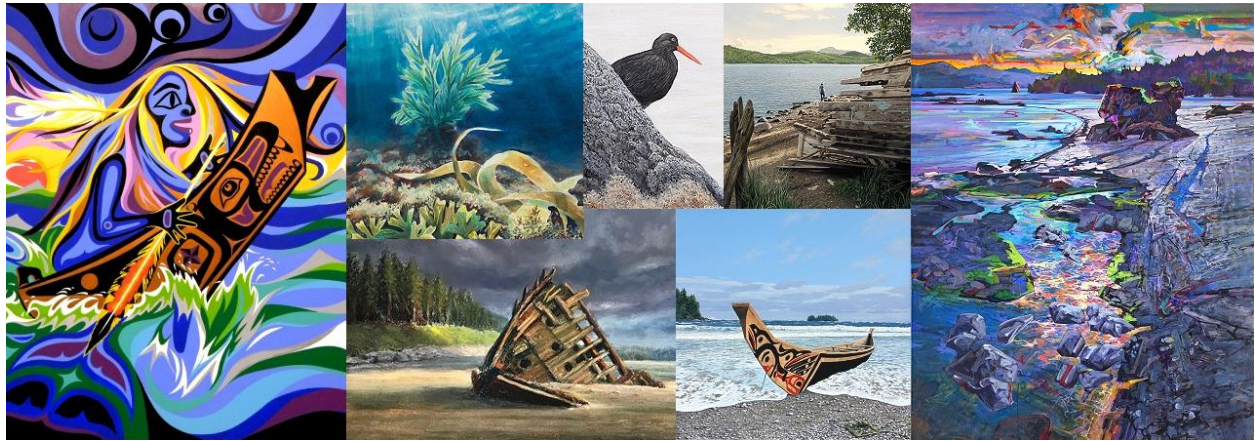
Paintings by the Eyes of Society

The Maritime Museum of BC is pleased to announce the opening of a new art show titled 'Eyes Of Society - A Regionalist Perspective' by a series of Canadian artists, on from September 5 th to November 30 th , 2019.