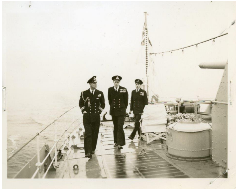
Prince Phillip aboard HMCS Crusader making the trip from Vancouver to Victoria, 21 October 1951