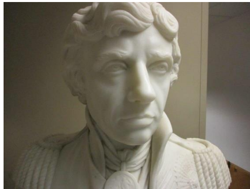
Bust of Nelson, Maritime Museum of BC