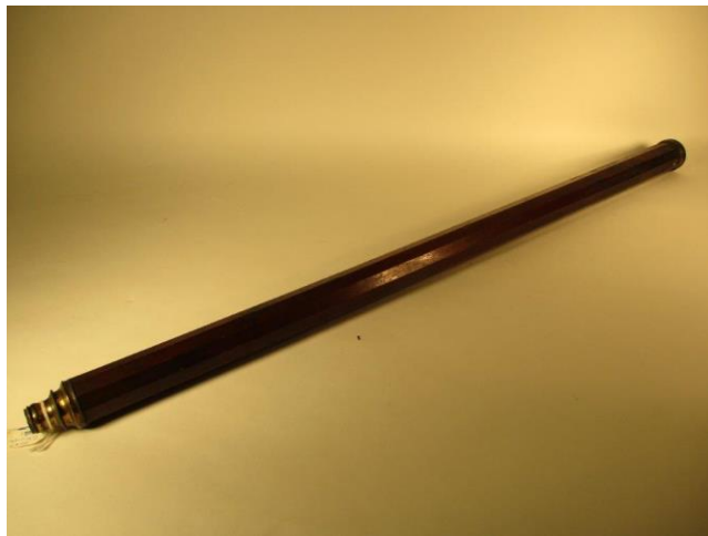
Wooden Telescope, Maritime Museum of BC