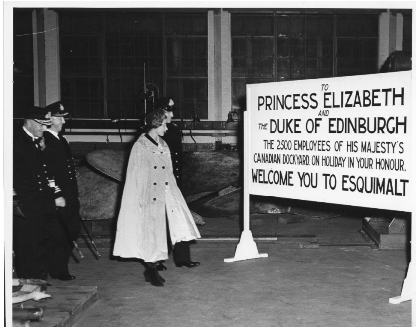
The Royals are welcomed to Esquimalt