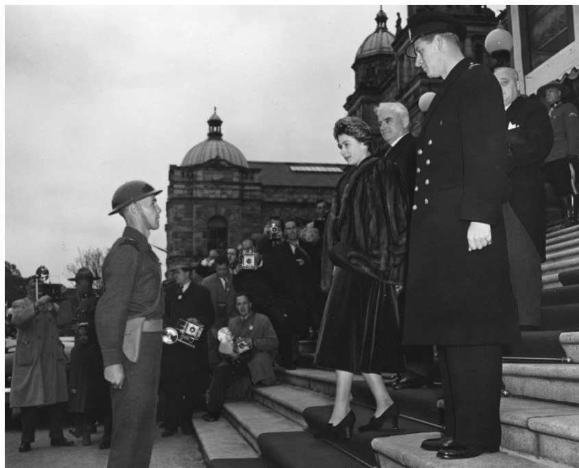
Ceremony at the Legislature