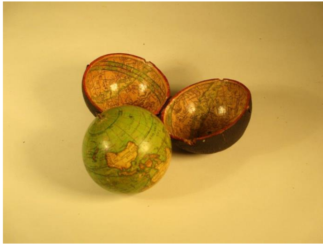
Pocket Globe, Maritime Museum of BC